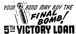
Number VL 19