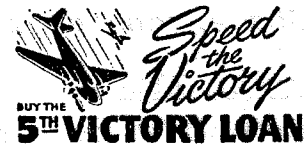
Number VL 20

Make your choice of one of these designs. Then use the enclosed postage paid order card immediately.