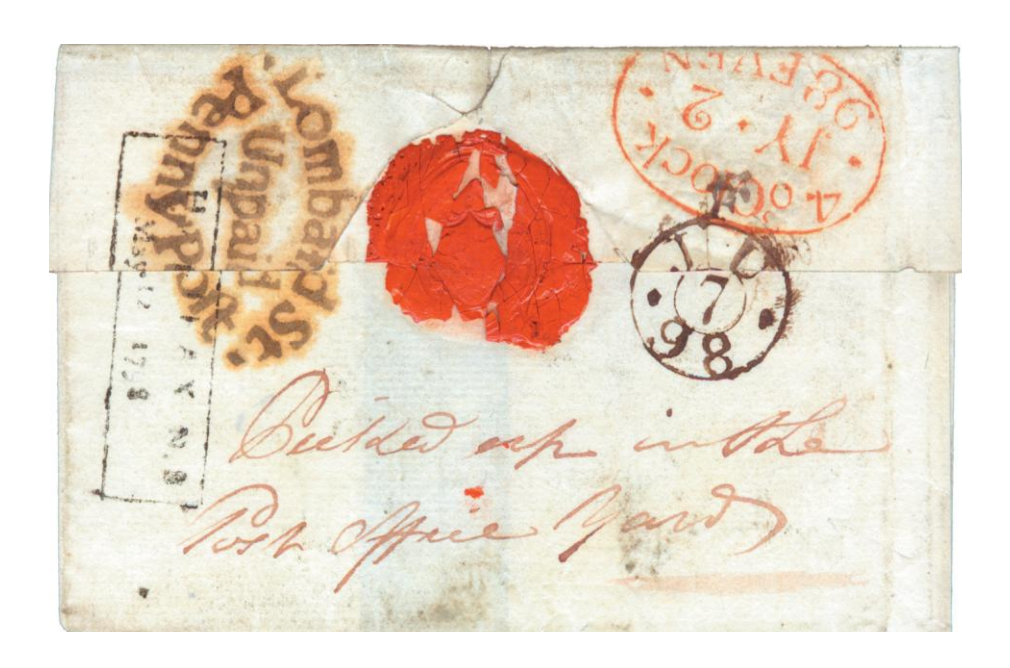
1798 – Halifax to London with the Two Line Boxed – HALIFAX N.S. MAY 12 1798 – Straightline Datestamp – Per Falmouth Packet – Collect – Manuscript endorsed – Picked up in the Post Office Yard .