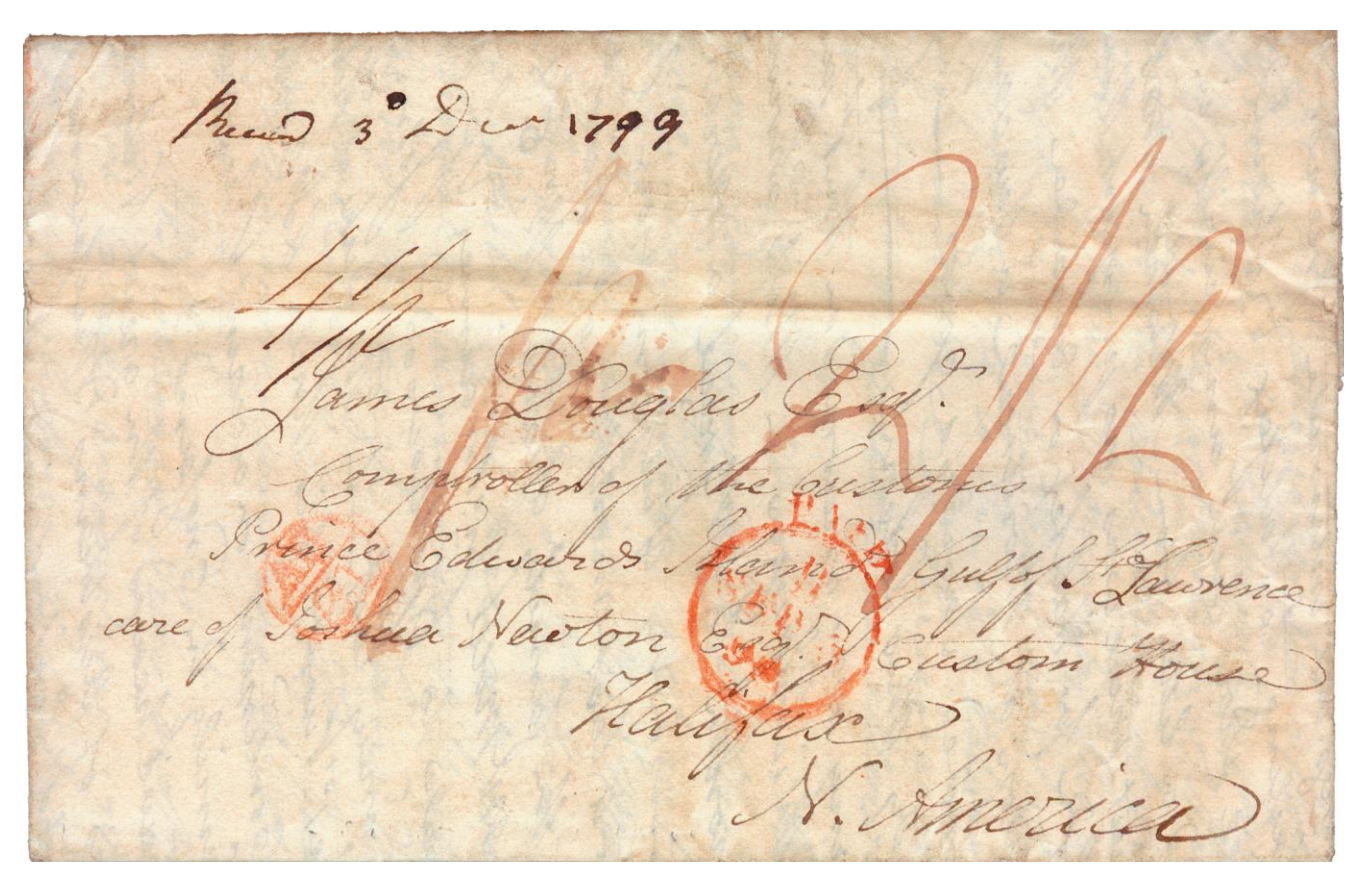
1799 – August 31 – The earliest recorded cover with the new name Prince Edward Island to P.E.I. – The official new name was passed by the legislature 20 November 1798 – Effective 3 June 1799.