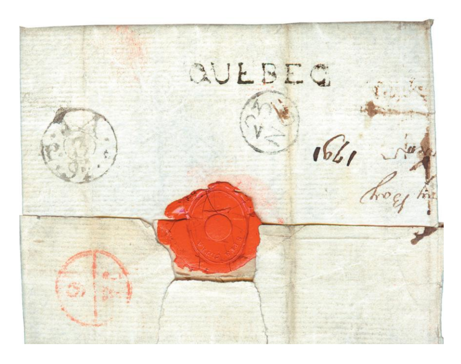
1791 – Murray Bay via Quebec per Falmouth Packet to Britain. – With the early type – Quebec – Straightline Handstamp and a Quebec Bishop Mark Handstamp.