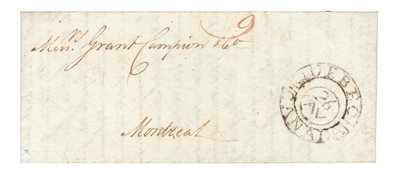
1793 – Barcelona, Spain to Montreal via Quebec – By private ship outside the Post and placed in the mails at Quebec – QUEBEC CANADA – Enclosed Double Semi-Circle – With – 26 AV – Bishop Mark.