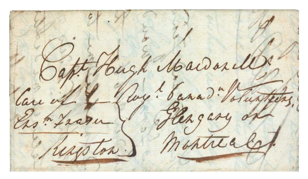
May 20, 1795 – Oswego, New York to Glengary or Montreal, Canada – From a Canadian Military Officer in the Royal Canadian Volunteers – A British Line Regiment raised in Canada – From Fort Ontario.

– Both covers are British Forts on American Territory still in British hands after the 1783 Treaty of Paris not returned to the U.S.A. until 1796.