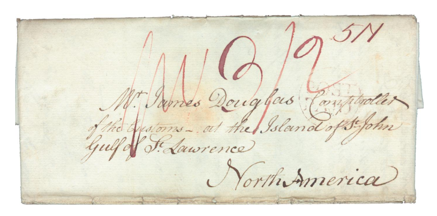
1789 – Scotland to Prince Edward Island via Halifax and Quebec – Endorsed over – Sent from the General Post Office, in the Mail for Quebec, to Halifax – in error.