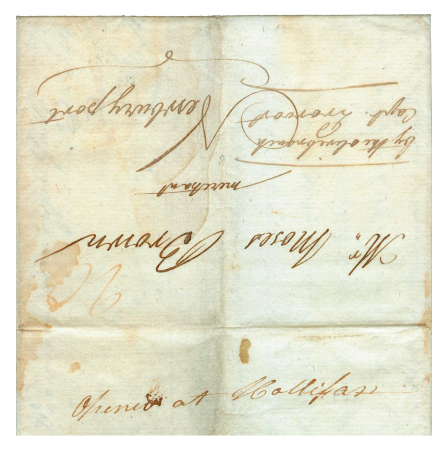
1795 – Holland to U.S.A. by Private Ship during Anglo-French War – Ship's Mail Censored by British – Manuscript – Opened at Halifax – Ship to Halifax either forced or voluntary.