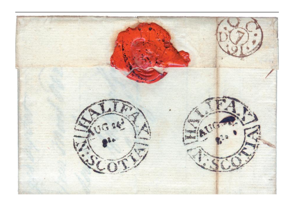
1791 – Halifax to London – Per Falmouth Packet Collect – The only reported cover with two strikes of the – HALIFAX N: SCOTIA – Double enclosed semi-circle handstamp. – The first strike has the wrong date.