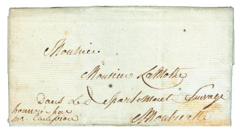
September 2, 1795 – Michilimackinac, Michigan to Montreal from a fur trader. Endorsed – hounoré par / M. Campion – favoured outside the Post to Montreal.