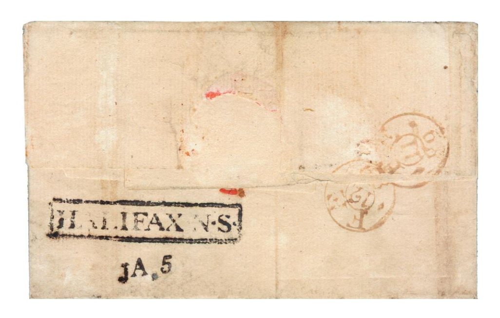
1789 – Halifax to London with the Heavy Boxed – HALIFAX N•S• – Straightline Handstamp with separate – JA. 5 – Datestamp – Per Falmouth Packet – Collect.