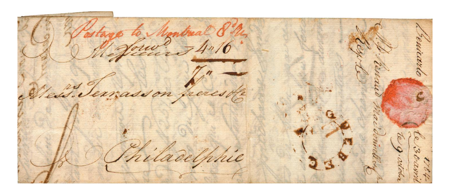
1784 – Benicarlo, Spain to Philadelphia, U.S.A. via Quebec and Montreal – Rated in Sterling – Quebec to Montreal and Pennyweights / Grains Silver to Philadelphia.