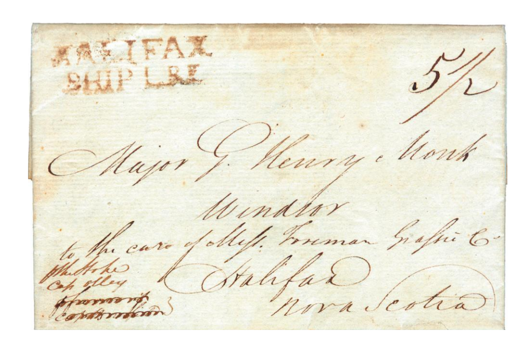
1799 – London to Windsor, N.S. – With red two line – HALIFAX SHIP LRE – Handstamp and red – HALIFAX / AUG 18 99 – Straightline Handstamp over.