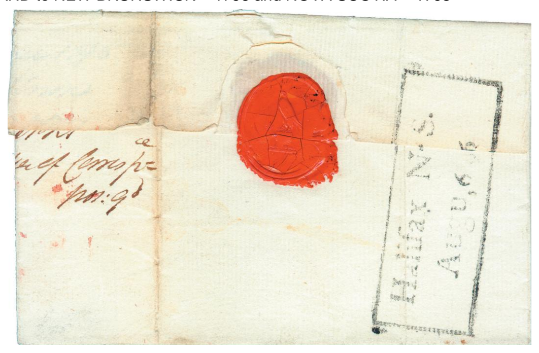
1796 - England to St. John, New Brunswick - Prepaid to Halifax with the large boxed - HALIFAX N•S•/ Augu,6 96 - datestamp.