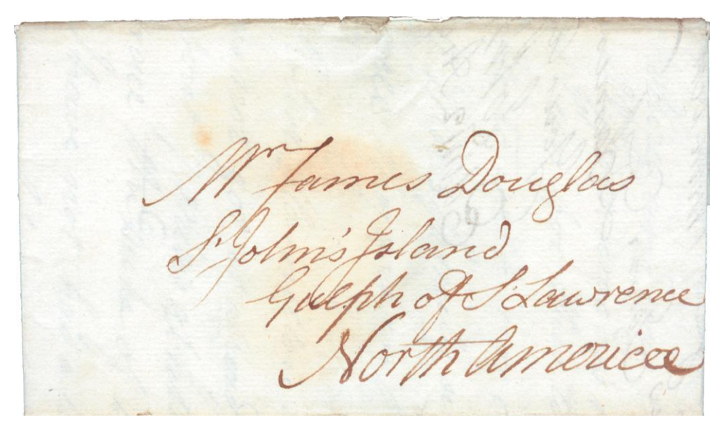
1789 – The earliest recorded cover from Britain to Prince Edward Island – Formerly St. John's Island.