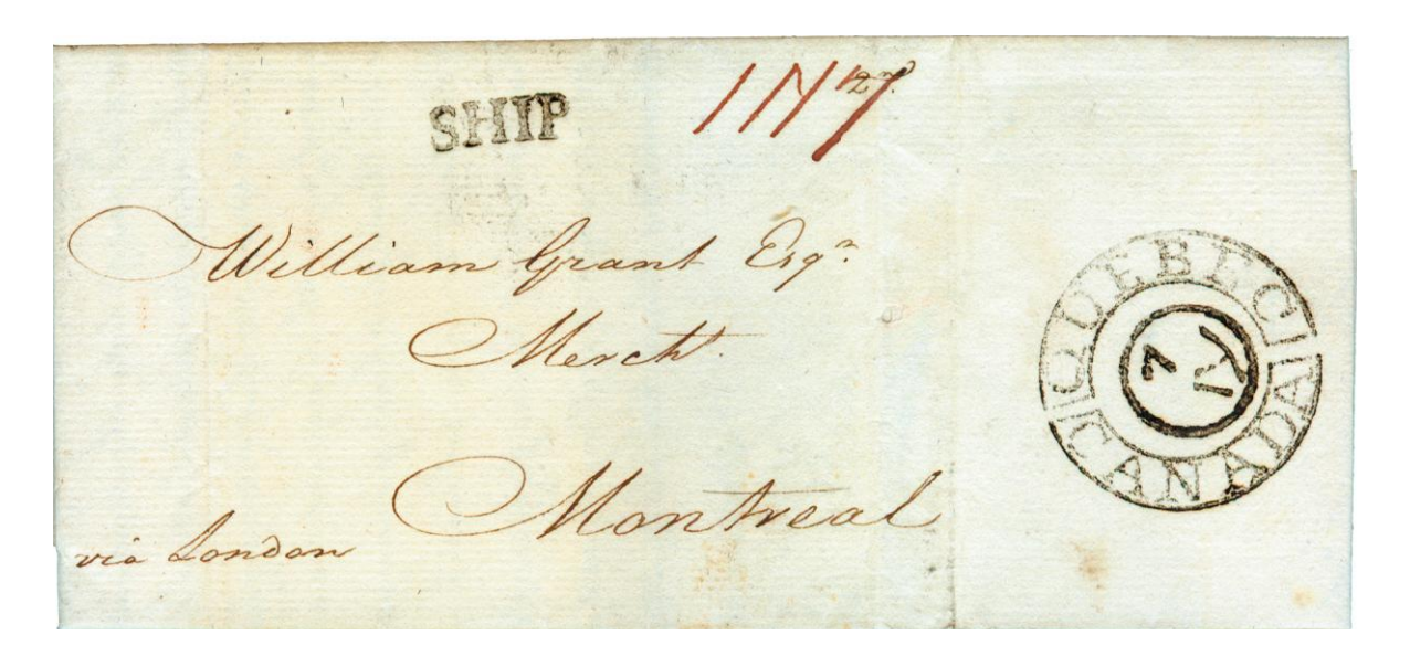
1793 – England to Montreal by Private Ship – With a Quebec – SHIP – Handstamp and a – QUEBEC CANADA – Circle Handstamp with a Bishop Mark insert – Double Rate Collect plus Ship Fee.