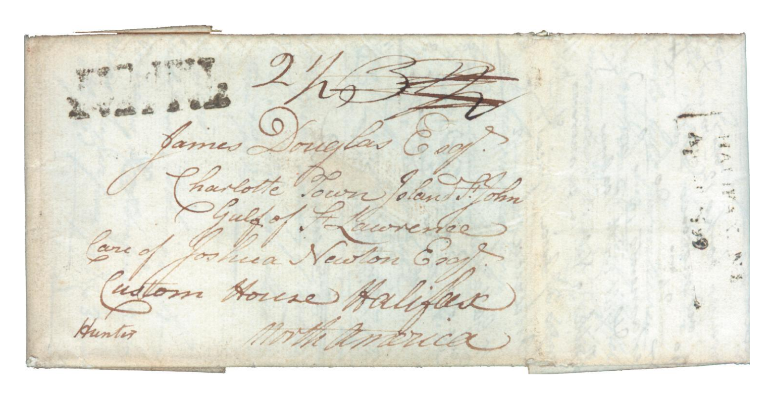
1799 - Scotland to Prince Edward Island – With a two line – HALIFAX / SHIP LRE – and boxed HALIFAX / Apr 26, 1799 – Straightline datestamp.