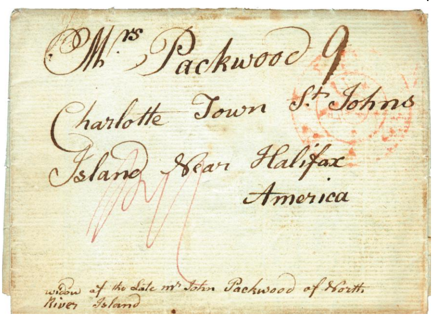
1793 – London to Prince Edward Island via Halifax per Falmouth Packet with – HALIFAX / N: SCOTIA – Datestamp over – Formerly the earliest recorded cover to P.E.I. as noted in Lehr .