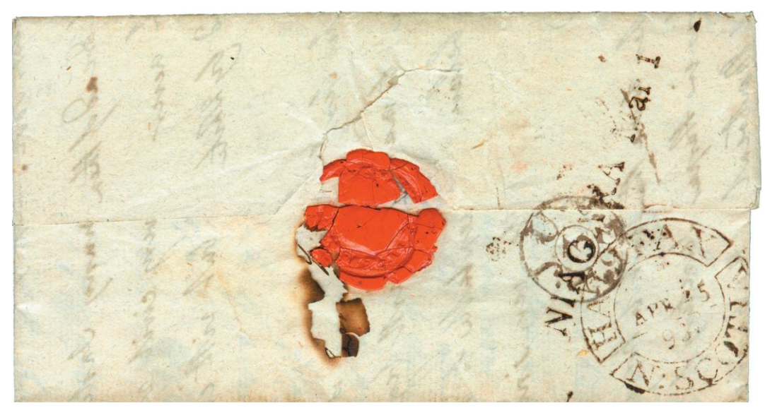
1793 – Niagara, Upper Canada to England via Halifax per Falmouth Packet – Paid to Halifax with the uncommon – NIAGARA Mar 1 – Straightline Datestamp and the large – HALIFAX - N: SCOTIA semi-circle datestamp.