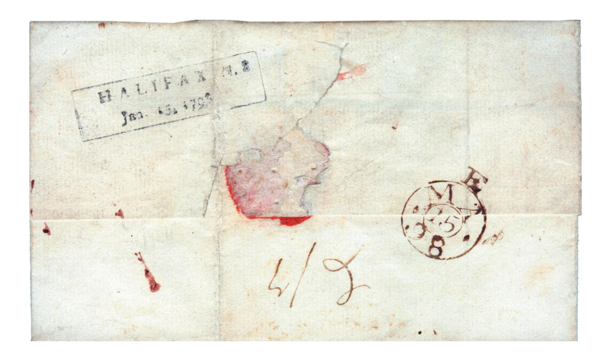
1798 – Halifax to London – Per Falmouth Packet Collect – With the small boxed – HALIFAX N. S. – Straightline Handstamp.