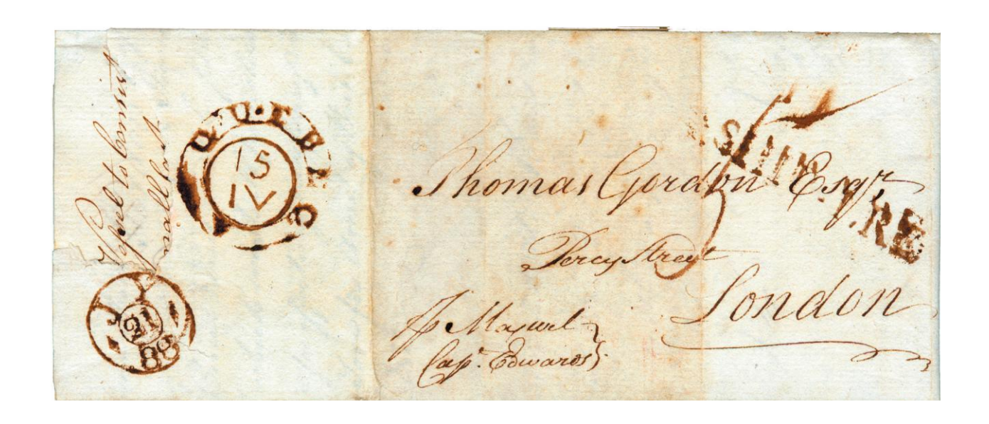
1788 – Quebec to London – By Private Ship with Quebec Circular Handstamp and Bishop Mark insert – London – SHIP LRE – Handstamp.