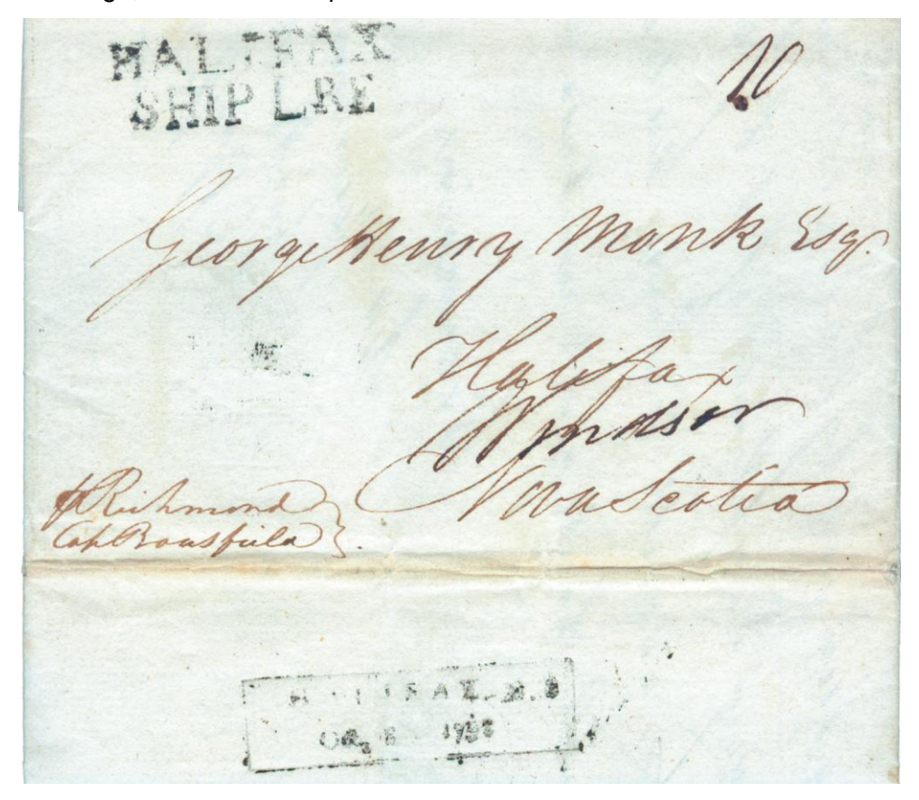
1798 – London to Halifax, N.S. – With the small boxed – HALIFAX N.S. – datestamp and two line – HALIFAX / SHIP LRE – handstamp.