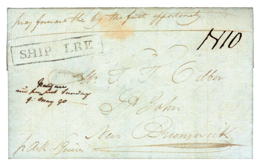
1790 – London to St. John, N.B. – With boxed Halifax – SHIP LRE – On reverse – HALIFAX / N: SCOTIA – Double enclosed semi-circles and manuscript note – Found open – Signed by three Post Office officials.