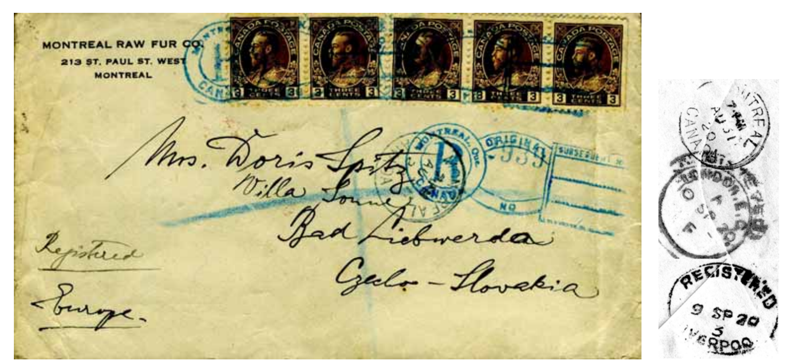
Montreal-Czechoslovakia, 1920. Rated 10¢ registration and 5¢ UPU. Stamps killed with keyhole handstamp.