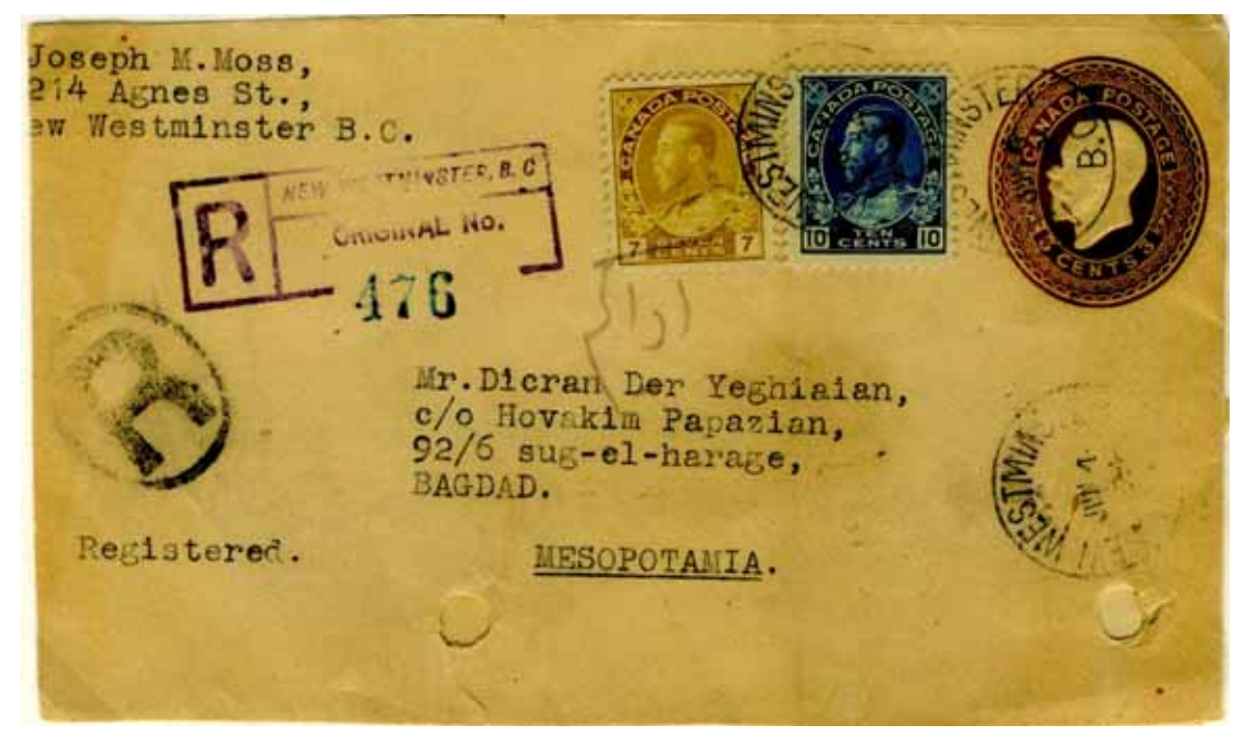
Single rate, New Westminister (BC)– Baghdad ( Mesopotamia, now Iraq ), 1924. Rated 10¢ registration and UPU 10¢ first ounce.