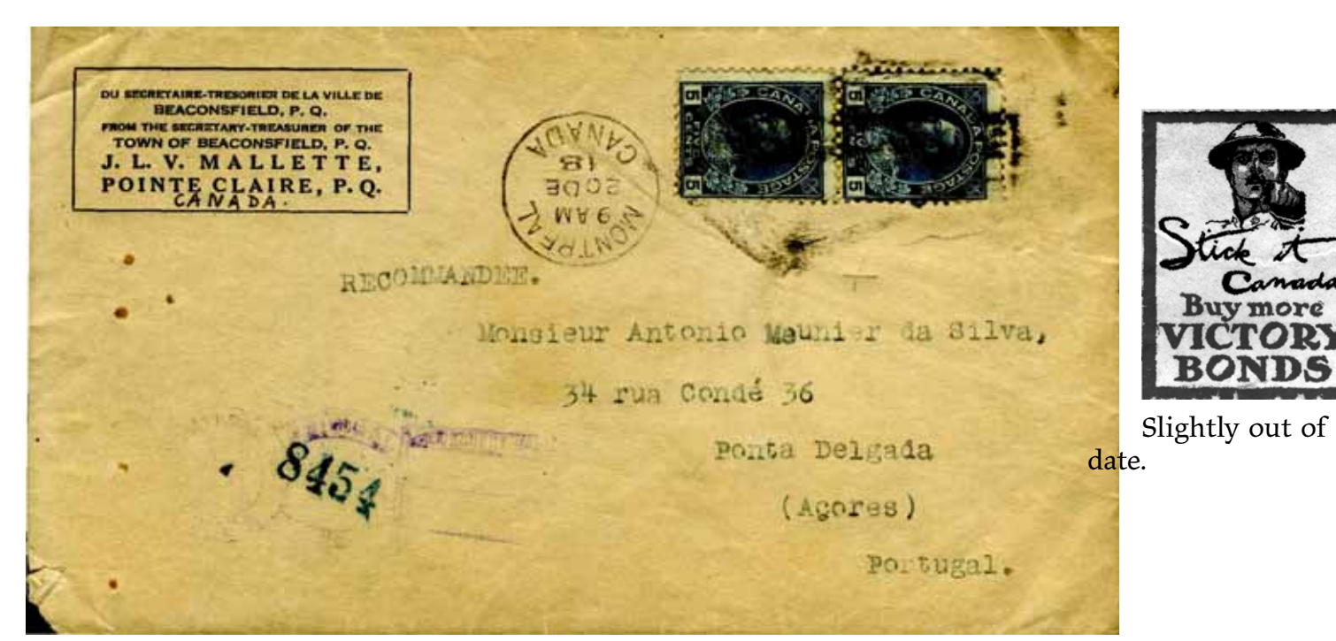
Montreal - Azores, December 1918. Rated 5¢ registration and 5¢ UPU rate.

The war ended officially on 11 November 1918.